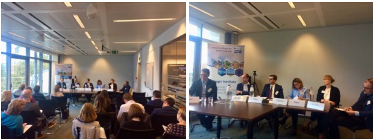
Figure C1: Insights from the workshop

In general, feedback on the catalogue suggested that in the future additional attention should be given to contextual circumstances, such as access to energy but also political acceptance and feasibility as well as resource availability. To date, these have been difficult to work into scenario modelling.