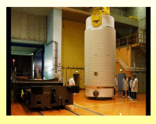
Interim Storage Facility Emsland