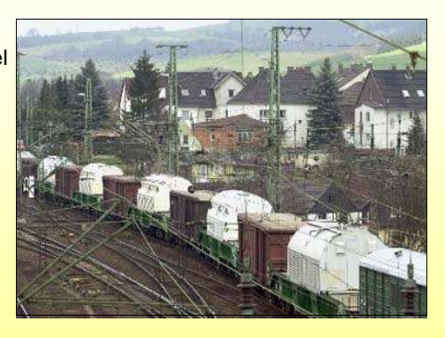
Radioactive Waste from Reprocessing